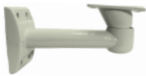
VHM-208 Mounting Bracket