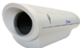
VCH-619 Housing Optional: Heater, Blower, IR