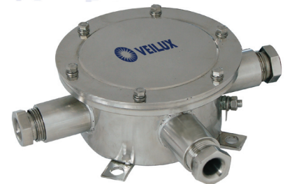
SVEX-JXD assist equipments of explosion proof television and communication system.