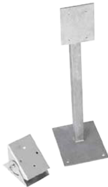
M1-Mounting bracket (long) w/ half-pan/tilt