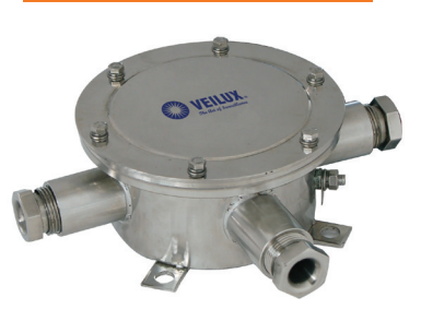
SVEX-JXD assist equipments of explosion proof television and communication system.