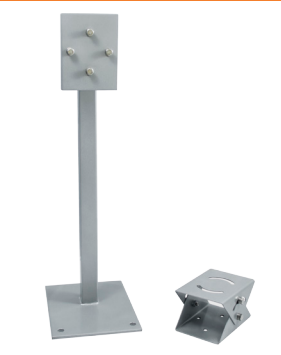
M1-Mounting bracket (long) with half pan/tilt